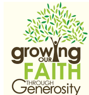
Plate Collection & Christmas Collection information will be posted in next week's bulletin.