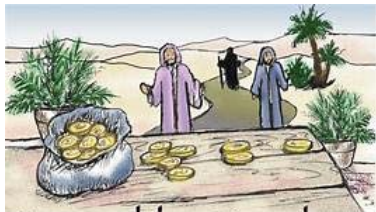
The Parable of the Talents