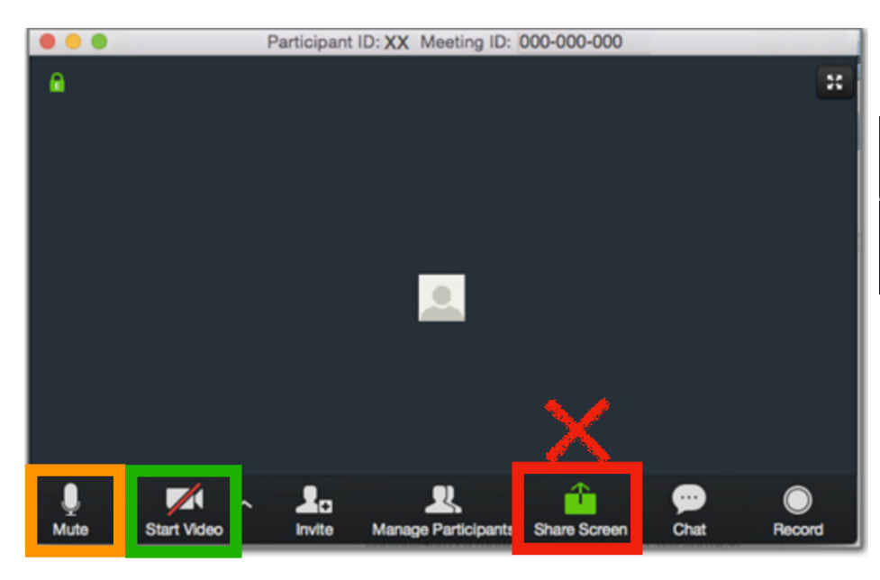
MACBOOK (BOTTOM OF SCREEN)