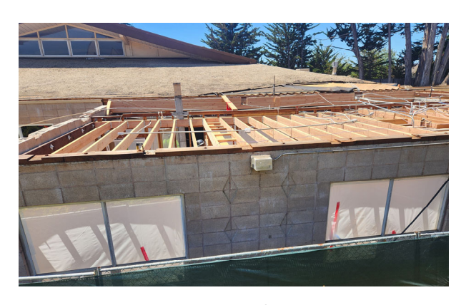
This picture shows the new framing above the offices.