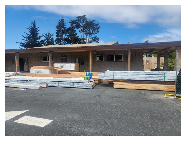
Looks like a lumber yard in the front of the hall