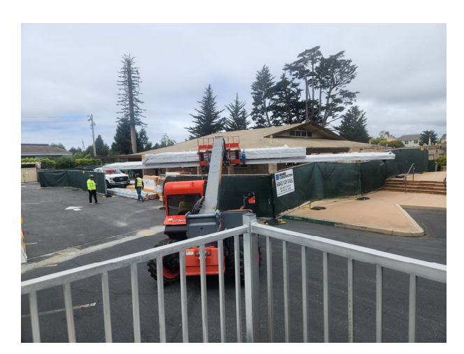
Here comes the wood for framing