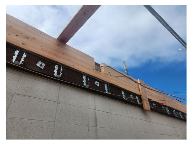
This is in the hallway from the main door to the old restrooms. The wood on top will provide strength.