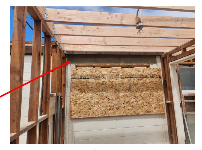
This picture shows the framing above the old women's restroom and the new header above the window that has been poured. See red arrow.