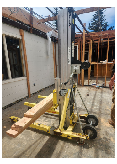
Genie Lift to move the lumber