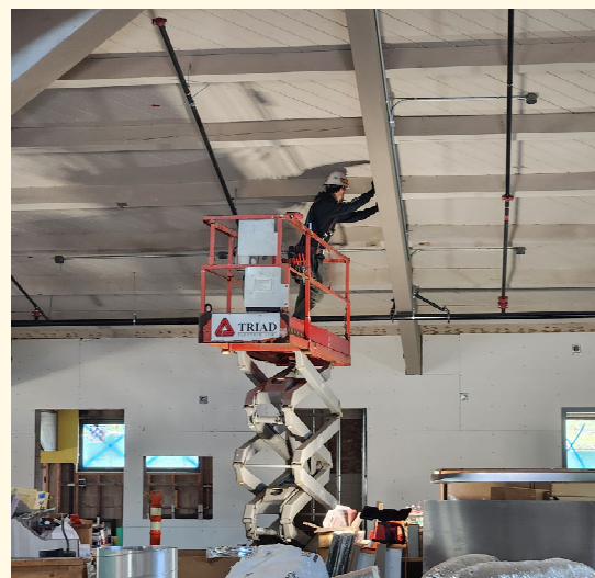
Our electrician installing conduit for the lights.

The dark rectangle to the right is an opening to the main office. A roll top door (so the office can be secured) & counter will be installed later.