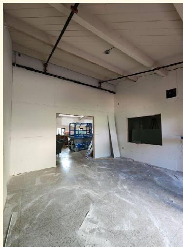
Sheetrock in the foyer.

This week: Sheetrock is going up inside all the rooms, electrical conduit is being installed for the lighting in the main part of the hall, prep continues for the stucco.