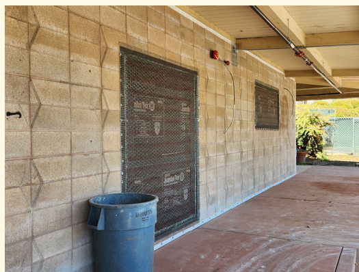
Stucco preparation on the hall facing the parking lot.