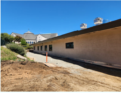
Grading & drainage work almost complete Exterior Painting is almost complete