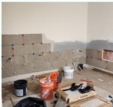
Tile installation in progress in the restrooms