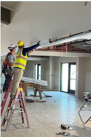
Prepping for new partitions in the meet- ing/classroom area