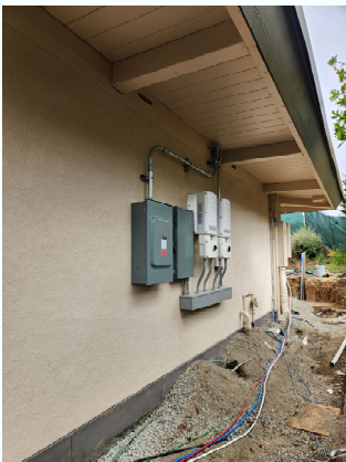
Solar equipment control installation