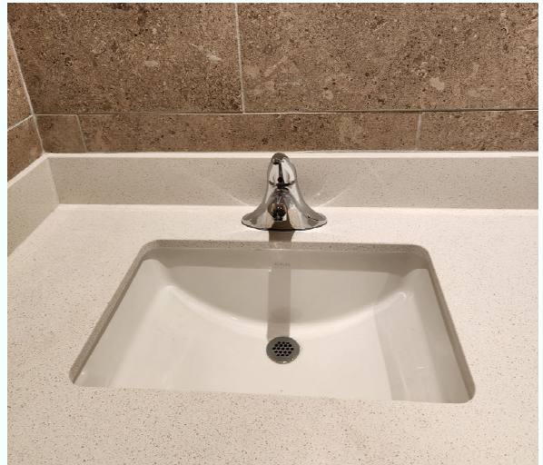
Sinks & Faucets are being installed in the restrooms Toilet partitions were installed.

We finally have a dedicated space for all our electrical components!