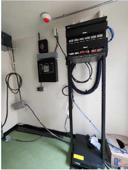
Fire Alarm System & Data Rack installed in the electrical room.

There are a lot of other electrical panels on the other two walls of this room.