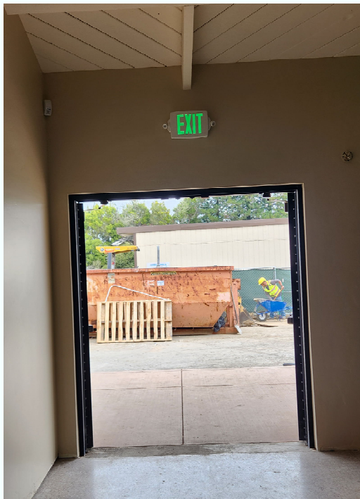
Exit Signs are being installed above the doorways.