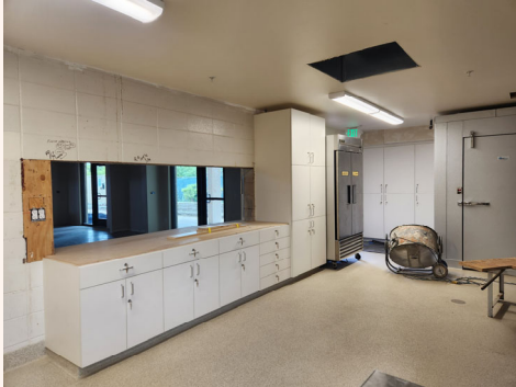
Kitchen Cabinets partially installed