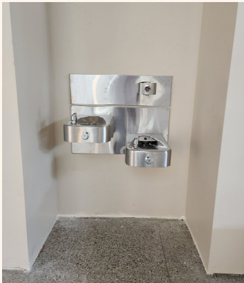
Drinking Fountain with Bottle Filler