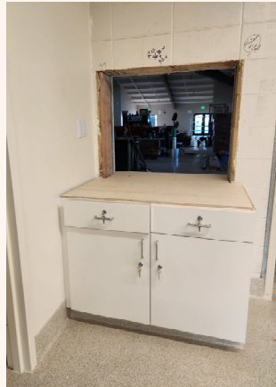
Coffee Station partially installed