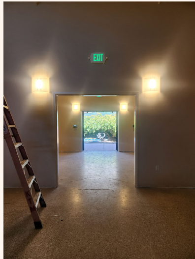
Lighting Sconces Installed by doorways