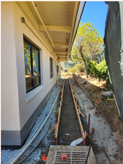
Drainage Work to prevent water intrusion