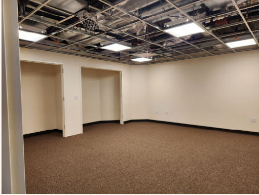
Carpet Installation is almost complete. This is one of the meeting rooms.